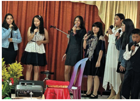
Sponsored students lead worship at the Amigos Church.