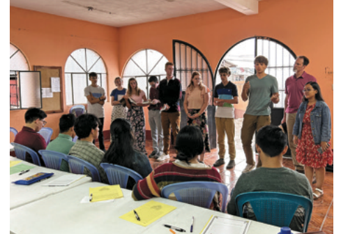
Youth Group shares with the college students.

Before the trip I felt inadequate, like I didn't belong, and God couldn't use me because I wasn't "holy enough" or "perfect enough." We gave the college students an identity bracelet that explains who we are in Christ, and we were asked to share personal examples. I didn't think I had anything to share, but one of the truths stood out to me. It is that we are not inferior but seated with Christ in Heaven (Ephesians 2:4-6). At the college meeting, I shared about this truth and saw God redeem my struggles for good. Although this trip didn't completely fix that issue, I was reminded that inferiority is a lie and that I belong to Christ.