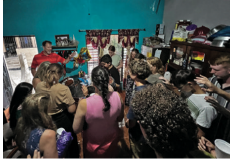
Praying with a family after a home visit.