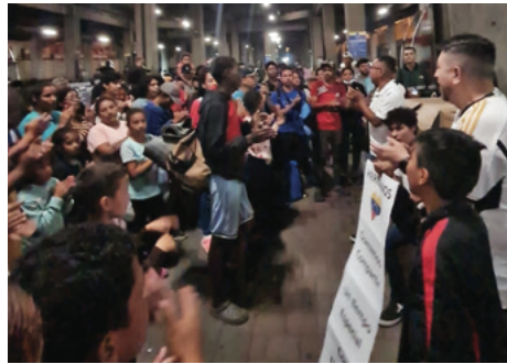
Many have accepted Christ during services for the homeless.

downtown bus station. They have a time of worship, share an evangelistic message, and provide a meal for nearly 100 people, made possible by CHM friends.